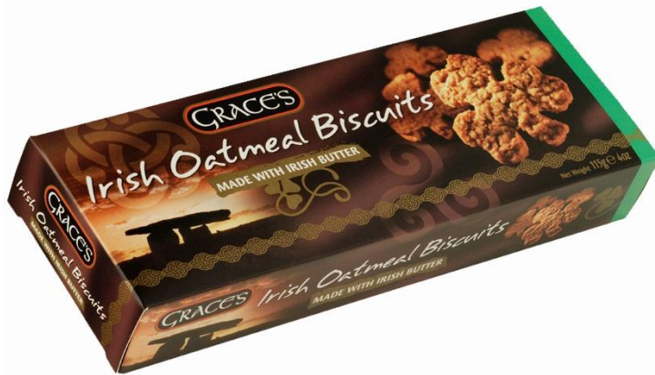
Grace's Irish Oatmeal Biscuits 135g 9 pack

The creamy buttery flavour is fused with a natural sweetness to offer a melt in the mouth taste sensation