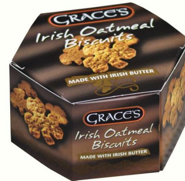
Grace's Irish Oatmeal Biscuits 37g 3 pack