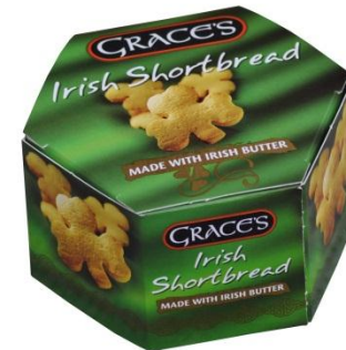
Grace's Irish Shortbread 37g 3 pack