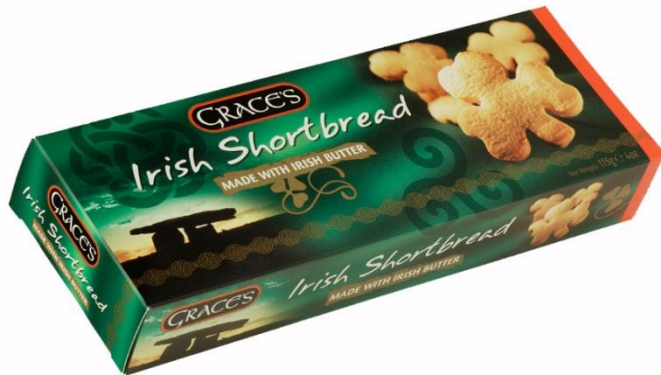
Grace's Irish Shortbread 135g 9 pack

The creamy buttery flavour is fused with a natural sweetness to offer a melt in the mouth taste sensation